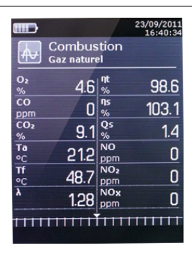
Example of analysis