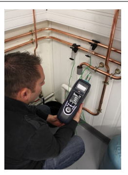
DHW network temperature